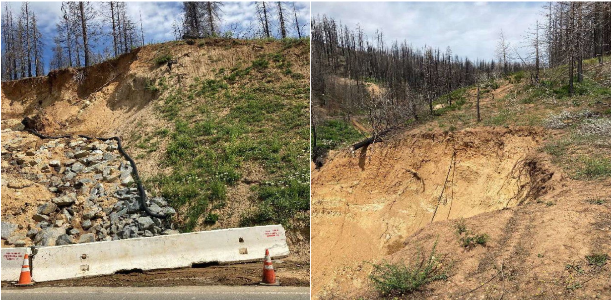
Recent Conditions on State Route 89, south of Canyon Dam Plumas County ####