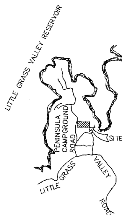
LOCATION MAP NO SCALE

3259 ESPLANADE, SUITE 102, CHICO, CA, 95973 PHONE 530.899.9503 FAX 530.899.9649