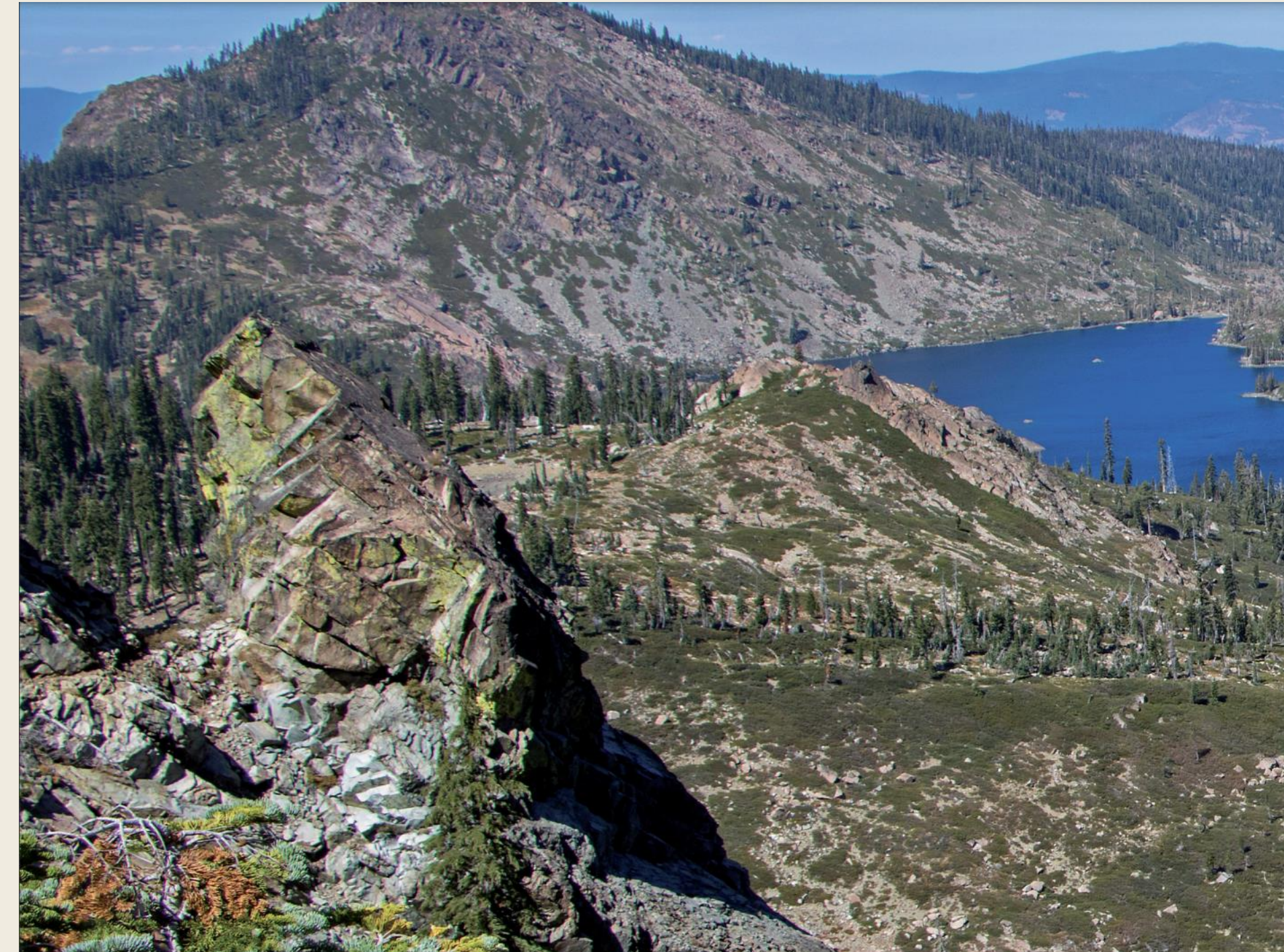
Plumas County Social Safety Net Needs Assessment